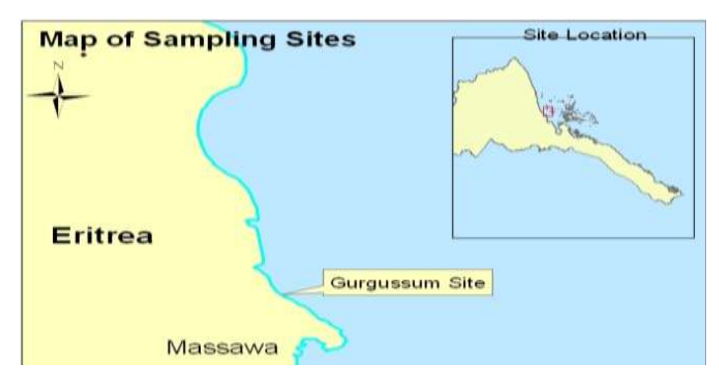
Figure 1: seaweed collection site (Gurgusum beach - 15° 40' N, 39° 25' E)