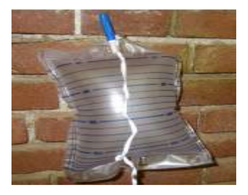
Figure 3: Gas collecting bag filled with biogas

The accumulated crude biogas was tested for its presence by flame test. The gas was slowly released from the plastic balloons and put across lighted match in dark room.