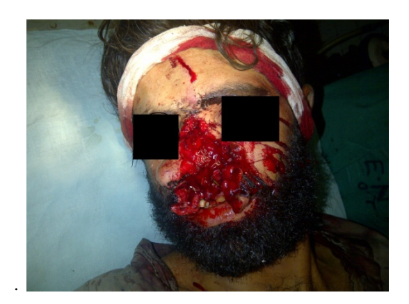
Figure 1 Figure 2