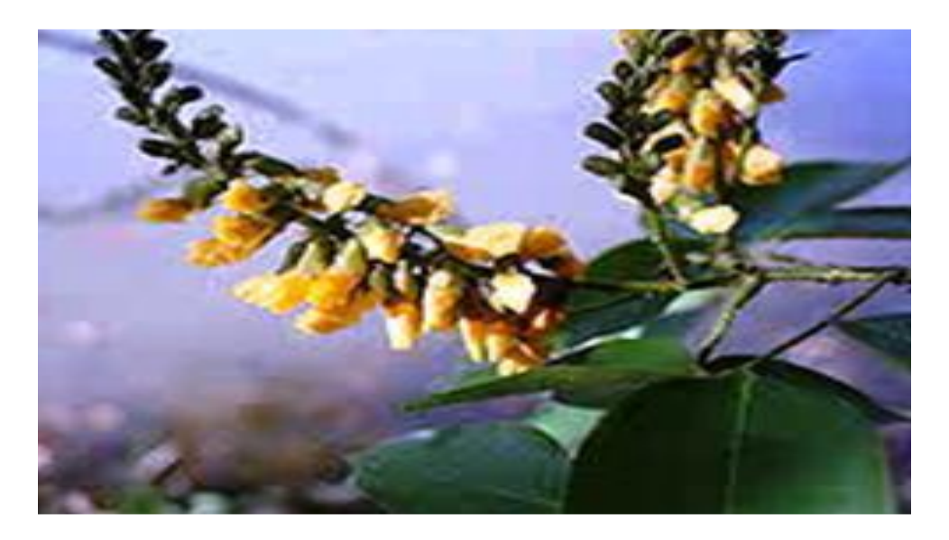
Figure 1: Leaves and Flowers of Pterocarpus santalinoides

However, despite that the leaves of Pterocarpus santalinoides and Ficus carpensis are used as vegetable in soup and preparation of sauce for cooked yam in Ebonyi State, no information has been published on the comparative proximate composition of the two plant leaves from Ebonyi State, Nigeria. In order to ascertain the nutritive value of the vegetable species and thereby stimulate interest in its utilization beyond the traditional localities. This study was designed to compare the composition of the proximate of the two plants leaf.