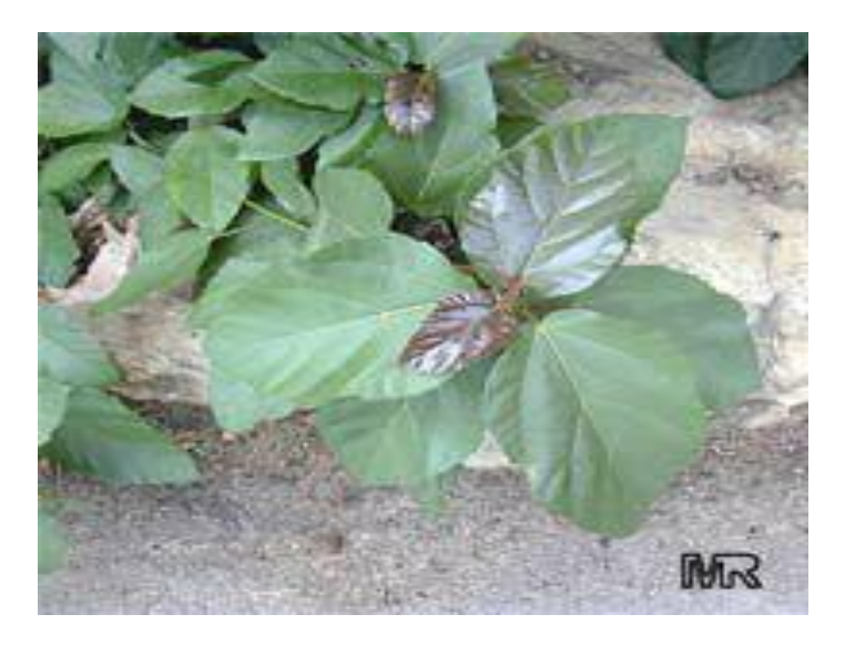
Figure 2: Leaves of Ficus carpensis